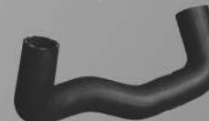
2018 | L4, 1.8L | 2009-98 Mang Rad Inf; S/ AC; Corta