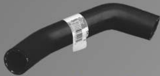
2017 | L4, 1.8L | 2009-98 Mang Rad Sup