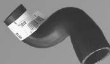
8010 | L4, 1.6L | 2012-94 Mang Rad Sup; AC