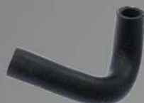
63121 | V6, 3.4L | 2008-06 Mang De Paso 3