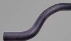
67076 | L4, 1.2L | 2017-11 Mang Rad Sup