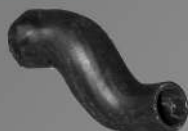
2043 | L4, 1.6L | 2012-94 Mang Tubo a BA